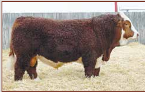
Virginia Precision 16C