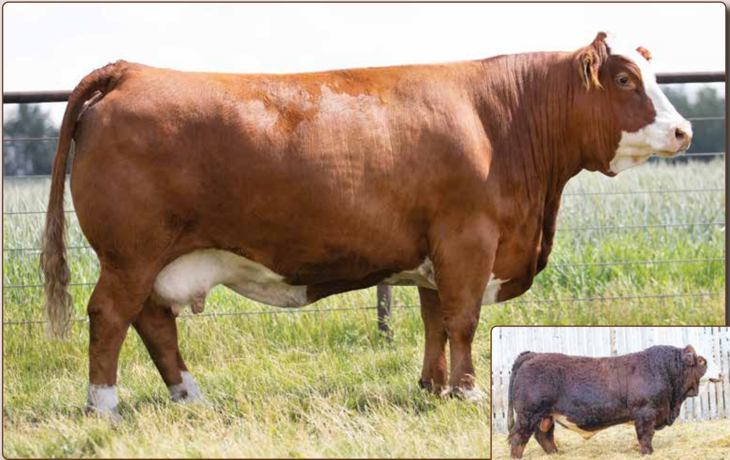
Anchor D Ziley 392Z