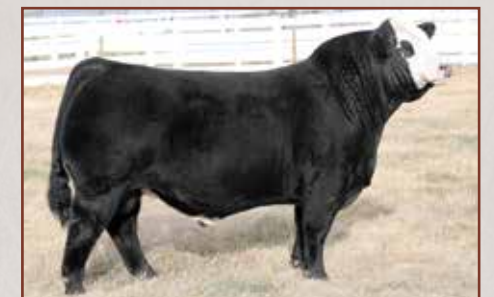
SRH Hannibal 5H

"Anchor D Simmentals striving for excellence in livestock production."