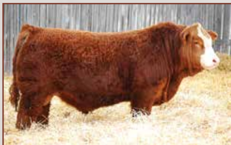
WLB Top Tier 456G