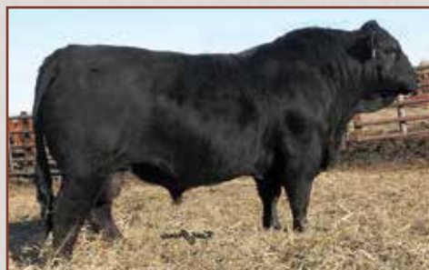
Sun Rise Pillar 3D