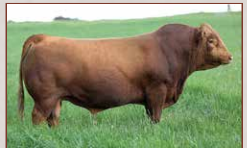
MRL Sleep Easy 140D