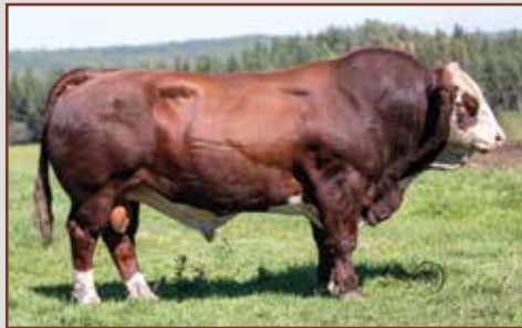
BHR Gannon G776