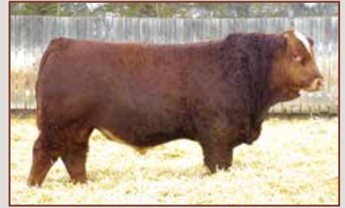
Anchor D Imax 250Y