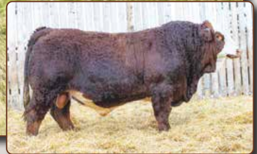
BLL Creed 950G