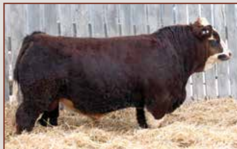
BEE Intrepid 111L