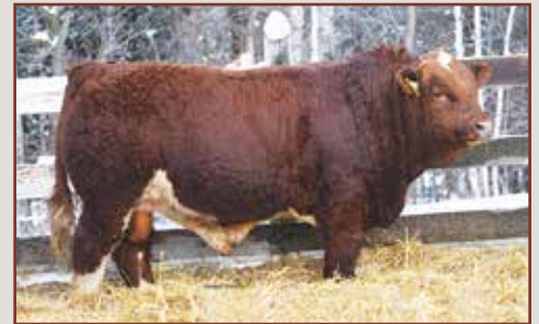
FGAF Radioactive 030E